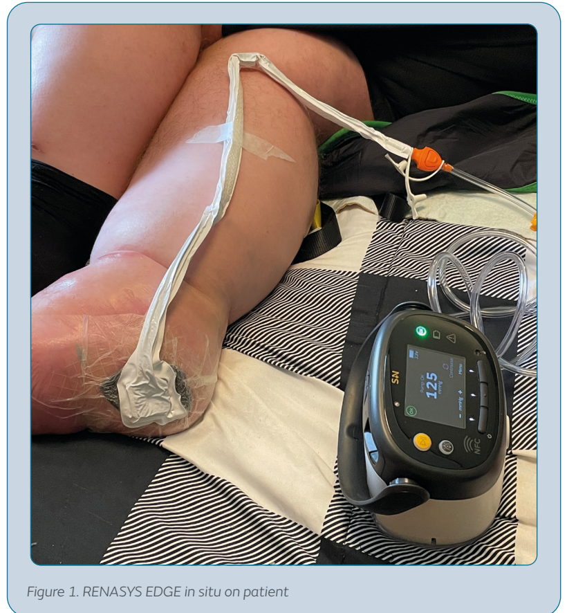
Figure 1. RENASYS EDGE in situ on patient